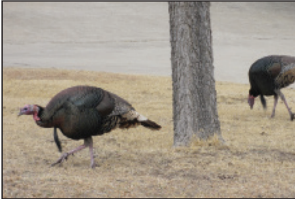
Landscaping provides habitat for wildlife.