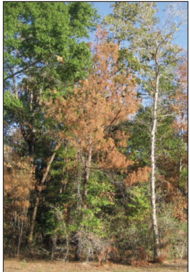
Ladder fuels allow ground fires to spread to the crowns of trees. Once in the crowns, a wildfire is very hard to stop.

Plants placed so that a fire can spread to your home increase the chance of your home receiving direct flame and embers as the fire spreads. Your home is a continuation of the fuel. Creating “defensible space” will greatly reduce your home’s risk to wildfire.