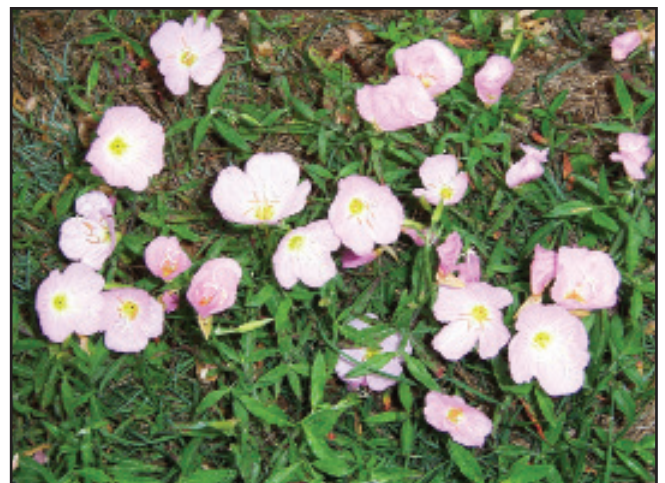
Mexican primrose, a low growing plant, helps maintain the vertical separation of fuels.