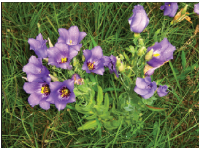
The high moisture content of the Texas bluebell makes it slower to ignite.