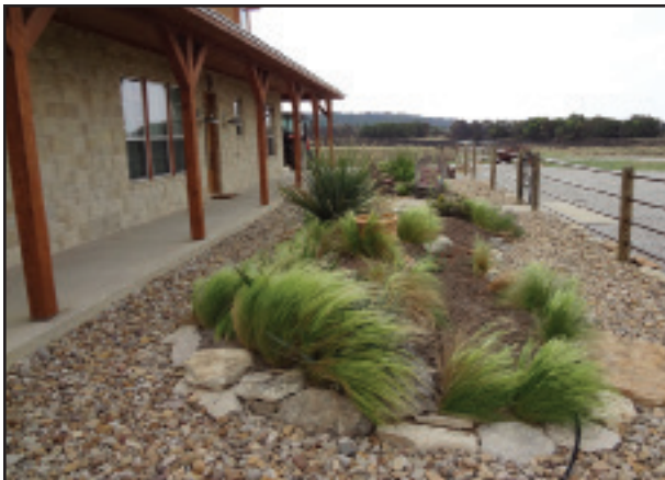
Native xeric landscaping allows water-wise practices to create a landscape that will flourish in hot and dry conditions.