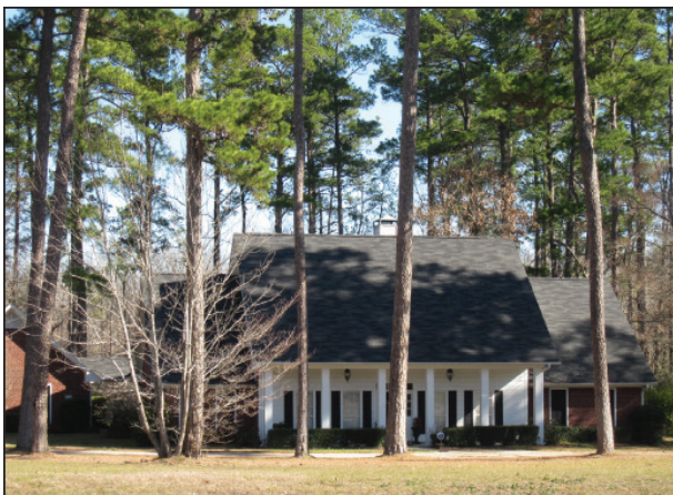
Landscaping reduces energy cost by providing shade from the home.

Firewise landscaping can be achieved along with other landscaping goals of landowners. Creating a safer Firewise landscape can easily fit into multiple goals just by using the right plants and proper spacing.