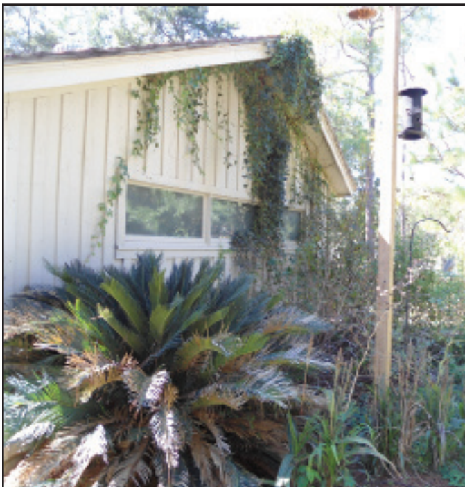
Overgrown vegetation that is within the 30 feet of defensible space can produce significant heat, potentially igniting the home.

Decks and siding easily can ignite when plants that burn quickly and produce high heat are placed adjacent to the home. A burning plant or group of plants in front of windows can cause glass breakage allowing fire to enter the home. Taller flames adjacent to the home can enter through the soffits. These flames may reach combustible materials and cause material failure, such as gutter or siding that melts, exposing the wood.