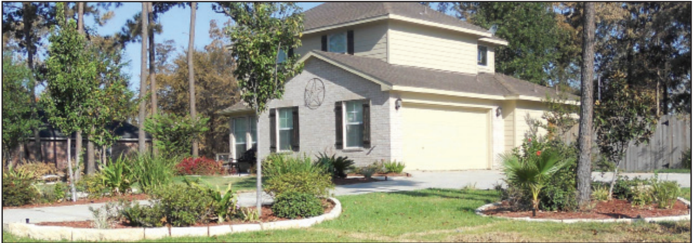
Island landscaping allows for space between fuels and will slow the spread of fire.

In Firewise landscaping, choose design elements using vertical and horizontal separation of plants. The most important portion of the home ignition zone is the defensible space. Highly flammable plants should be removed or isolated. Plants or plant groups should be placed using vertical and horizontal separation, breaking up the fuel continuity. Also remove dead and dying plants and plant materials.